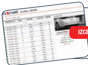
IZCENTRAL FOR CCURE SOFTWARE