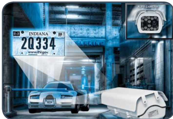
IZA500 Covering Parking Access Lane

The integration between INEX TECHNOLOGIES license plate readers and C•CURE 9000 enables the system to use vehicle license plates to grant or deny facility access.