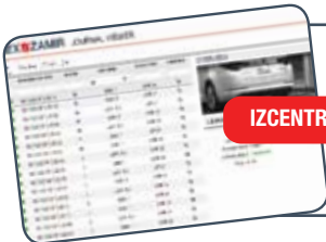
IZCENTRAL FOR LPRTRACKER SOFTWARE