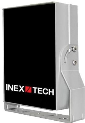
IZ-S1 LED Strobe