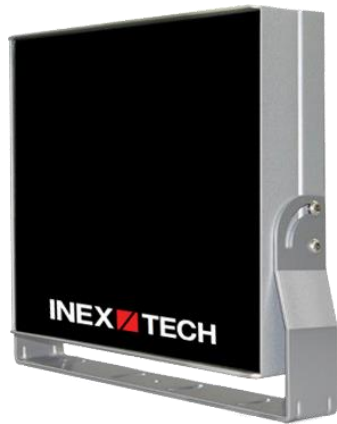
IZ-S2 LED Strobe