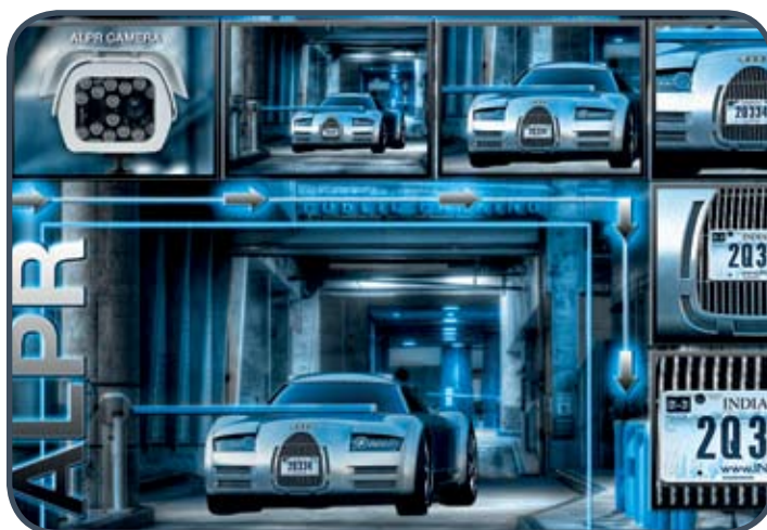
IZA500 Covering Parking Access Lane

The integration between INEX TECHNOLOGIES license plate readers and any Access Control System enables the system to use vehicle license plates to grant or deny facility access.