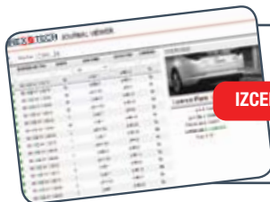
IZCENTRAL FOR ACCESS SOFTWARE