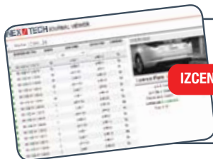
IZCENTRAL FOR OnGUARD SOFTWARE