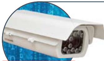
IZA500 ALL-IN-ONE SYSTEM