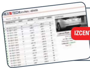
IZCENTRAL FOR S2 NETBOX SOFTWARE