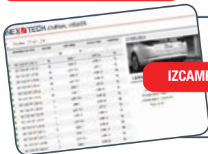
IZCAMP FOR RESERVATION SOFTWARE