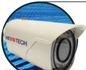
IZ600FJ CAMERA SYSTEM