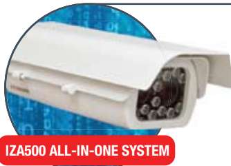
IZA500 ALL-IN-ONE SYSTEM