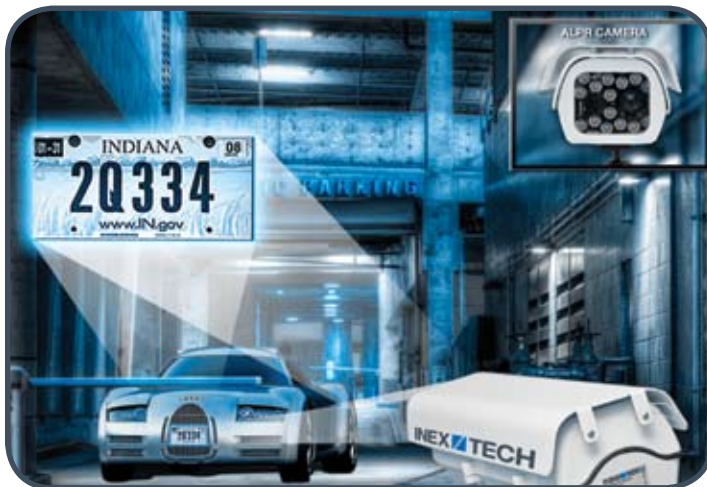
IZA500 Covering Parking Access Lane

The integration between INEX TECHNOLOGIES license plate readers and LENEL2 OnGuard enables the system to use vehicle license plates to grant or deny facility access.