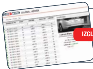
IZCLOUD FOR OnGUARD SOFTWARE