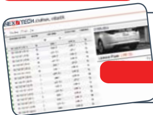
IZCLOUD FOR FIREFLY